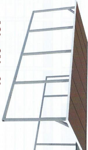
18' x 21' x 6' 14 GA, 2 1/2" Square Tubing