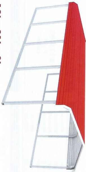
18' x 21' x 6' 14 GA, 2 1/2" Square Tubing

Certification available, and Certified Engineered Drawings also available for an additional charge.